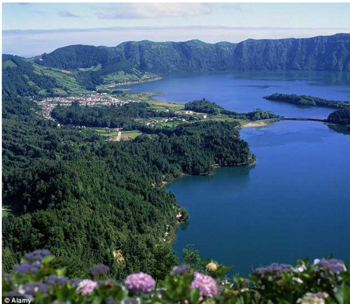
Tranquil: The Sete Cidades Lakes on the island of Sao Miguel in the Azores offer breath-taking views

Twenty minutes later, the boat is tossing around black Atlantic waves and the island is a green smudge on the horizon.